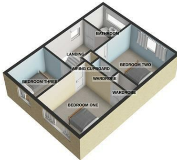
TOTAL FLOOR AREA : 1179 sq.ft. (109.6 sq.m.) approx.

For illustrative purposes only. Decorative finishes, fixtures, fittings and furnishings do not represent the current state of the property. Measurements are approximate. Not to scale. Made with Metropix © 2025